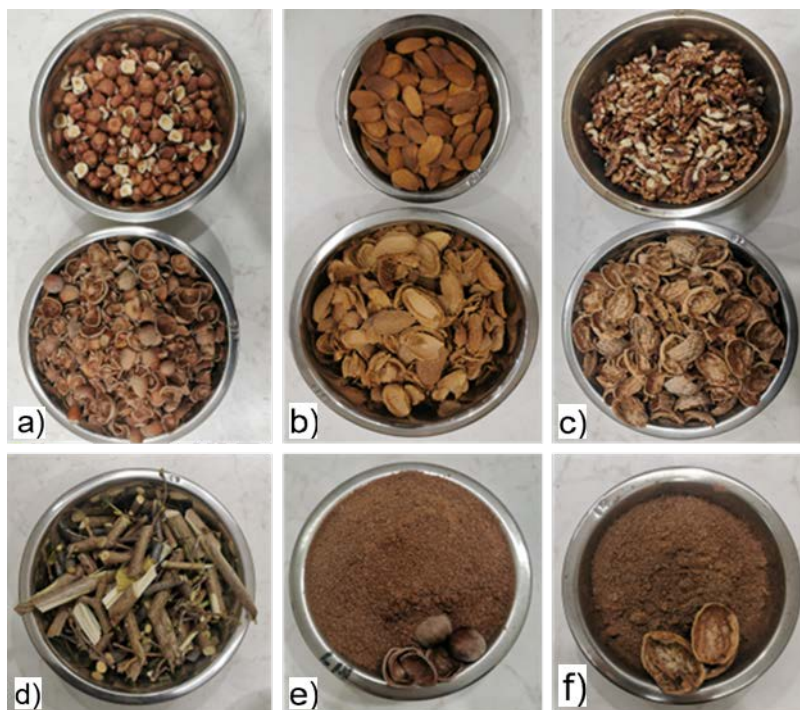
Figure 3. Biomass samples prepared according to SM EN ISO 14780:2017 requirements: a) hazelnut original fruits and endocarp; b) almond original fruits and endocarp; c) walnut kernel and endocarp; d) hazelnut branches; e) shredded hazelnut endocarp; f) shredded walnut endocarp.

All tests were repeated five times, and the standard deviation and confidence intervals were determined. The corresponding tables present the average values from these repetitions.