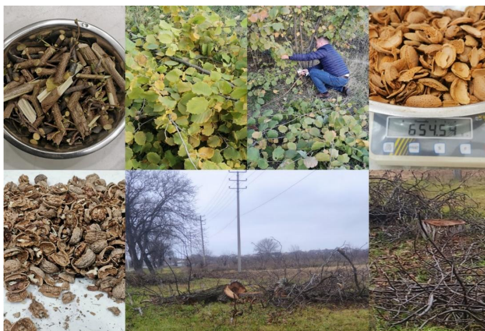
Figure 1. Sequences of walnut biomass sampling in Truseni commune, Chisinau municipality.

The investigation methodology was based on a systematic study conducted at the LSBCS of UTM, accredited by the National Accreditation Center of the Republic of Moldova [26]. The research was carried out in two distinct phases. In the first phase, biomass quantities from various walnut, hazelnut, and almond varieties were estimated. Experimental samples were collected from multiple locations: the Voinești Nursery in Voinescu village, Hâncești district; the CC Dumbrava Veche SRL in Radeni village, Straseni district; and various individual farms in Truseni commune, Chisinau municipality. Figure 1 presents sequences from the biomass sampling process.