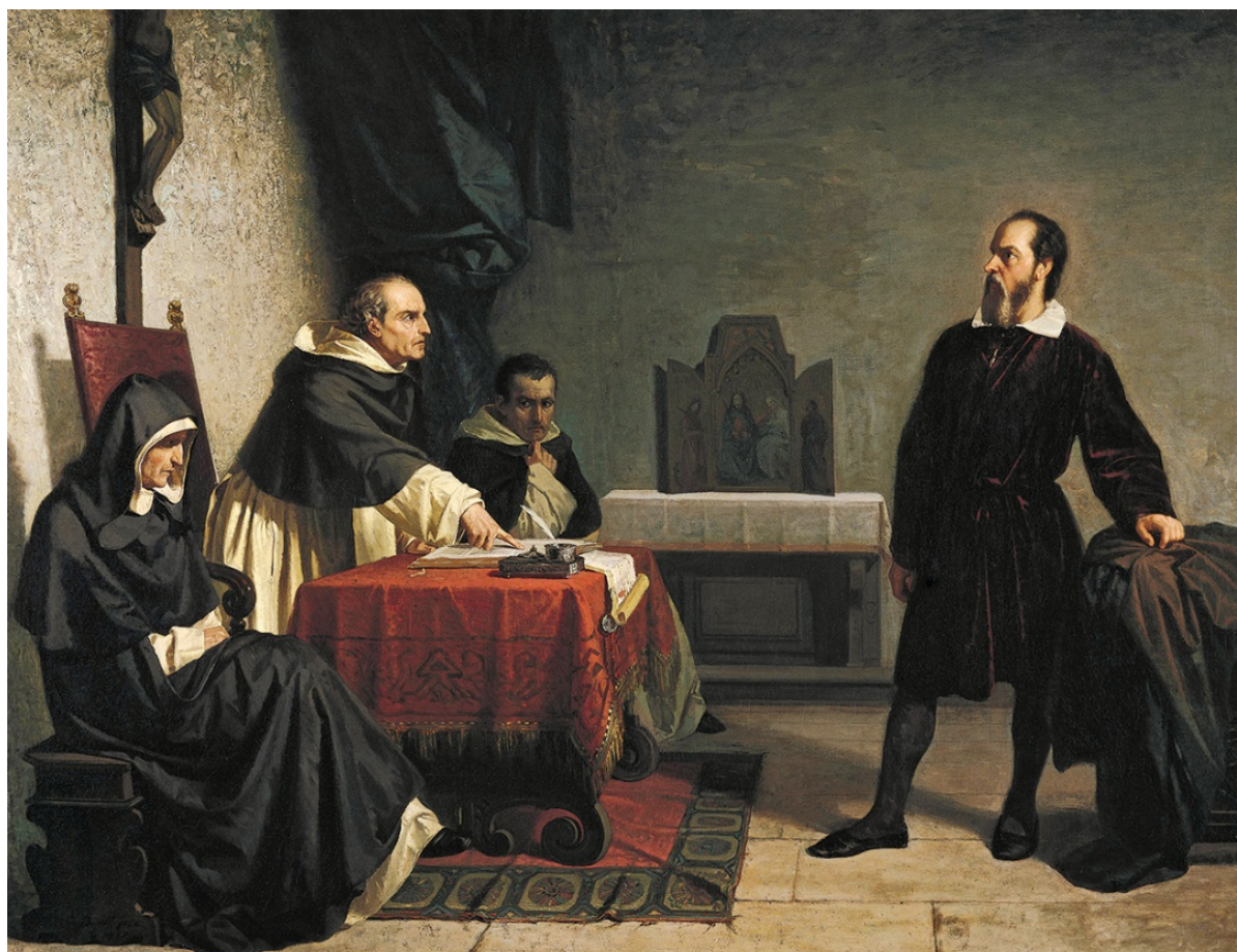
Figure 2. Banti, Galileo facing the Roman Inquisition [14] (online version is in colour).

On 12 and 30 April 1633, Galileo was interrogated by the Roman Inquisition, by the Dominican Vincenzo Maculani da Firenzuola (1578–1667), and formally charged on 10 May [6]. He was kept for two weeks in the building of the Inquisition. It is true that he was restricted to a confined place, and thus his confinement is referred to by Linder as imprisonment [1], but Galileo was placed in a comfortable apartment in the Holy Office fiscal's private residence, a layout sketch of which was reproduced by Gebler [4, p. 209]. This accommodation was far from a prison. After the first session, Firenzuola's strategy was to induce Galileo "to enter a guilty plea judicially" [4: 213] in exchange for a lenient sentence. During the second session, Galileo declared that he overstated the case in the previous session. Figure 2 shows an 1857 painting by Cristiano Banti (1824–1904) which depicts Galileo during a session with Firenzuola, who is standing at the table. The trial was then held.