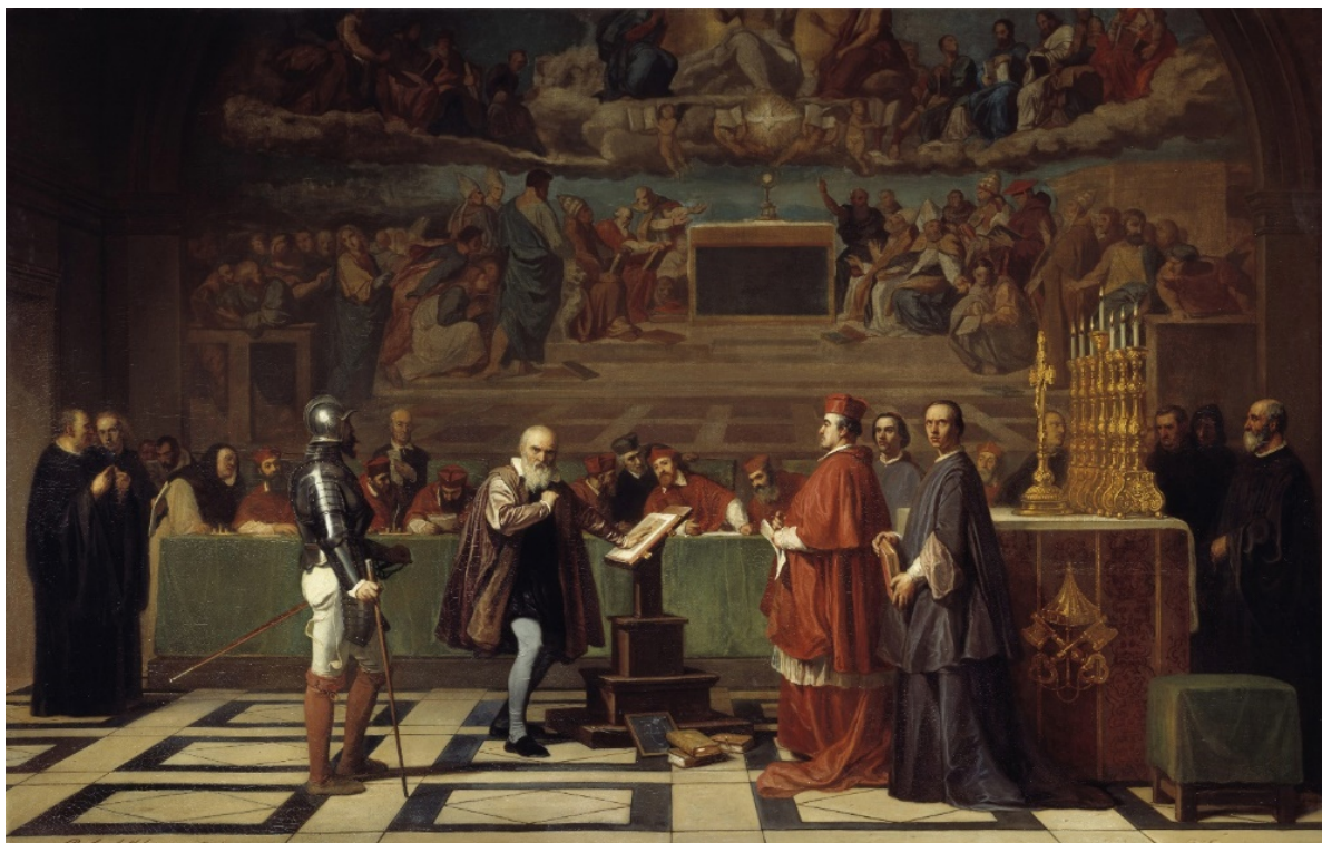
Figure 3. Robert-Fleury, Galileo before the Holy Office [15] (online version is in colour).

On 22 June 1633, Galileo was sentenced to life imprisonment, which was later commuted to house arrest. Seven out of the ten cardinal-inquisitors presiding at his trial signed the sentence (Table 3); Cardinal Barberini did not sign it. Galileo signed a formal recantation and was kept under house arrest at the residence of a former disciple and friend, the Archbishop of Siena.